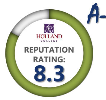
(On a 10-point scale)